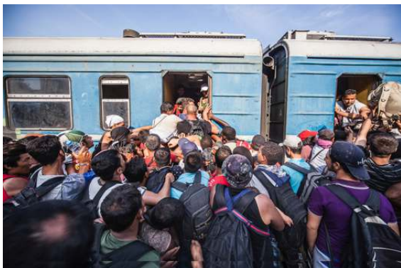
Refugees in FYROM, from GC Visual contest 2017

The next discussion organized by the alumni will be on March 20 on the right to clean air in Portugal.