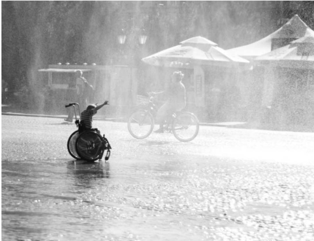
A boy. Winner of GCA Visual Contest 2018