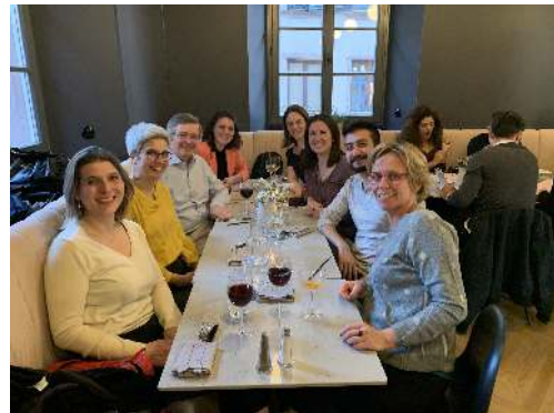
The Strassbourg hub in action.