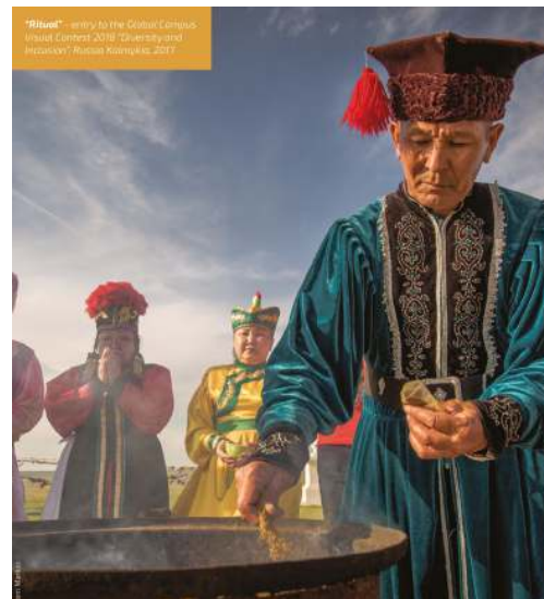
Outtake from the report

Two of the best photos of the Visual Contest ; the 2017 edition "Memory and reconciliation" and the 2018 "Diversity and Inclusion"-have been selected for the sections of the rights of the child and freedom of religion or belief of the 2018 EU annual report on Human Rights and Democracy in the world