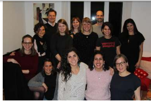
The Vienna hub meeting in March

The Rightsblog , an initiative by EMA alumni is looking for submissions for 2019. Rights! is an independent human rights platform where different ideas, approaches, interests and practices meet. The blog accepts