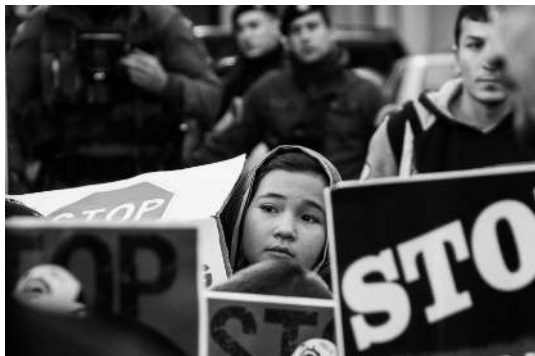
Photo of Afghan refugees protesting in Athens, Greece