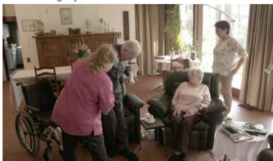
Still from Slavery of Care