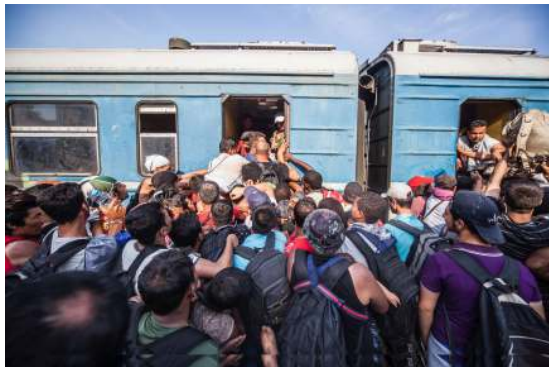
Refugees struggling to enter a train towards Serbia in Gevgelia, North Macedonia, 2015

If you want to see more of my documentary and photography work or where I have been published check out my website here: www.adam-jacobi.com .